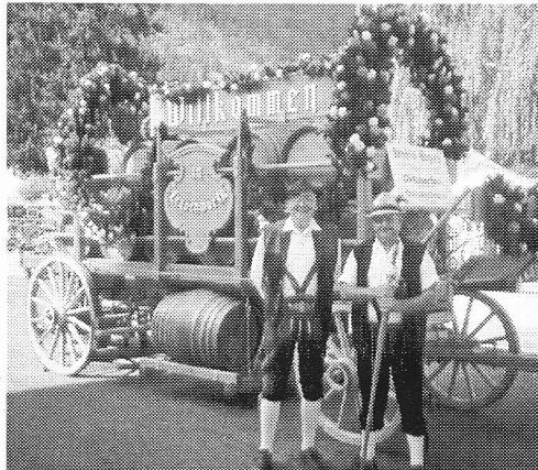
Leavenworth "Bavarians" proudly show off their parade entry—a Willkommen beer float (left). ...not to be confused with a root beer float!

And the sun did shine during the Cascader's Leavenworth rally as 26 coaches gathered in the little Bavarian town October 2, 3, and 4 to join in the celebration of the Autumn Leaf Festival. The Autumn Leaf Parade with floats and bands and