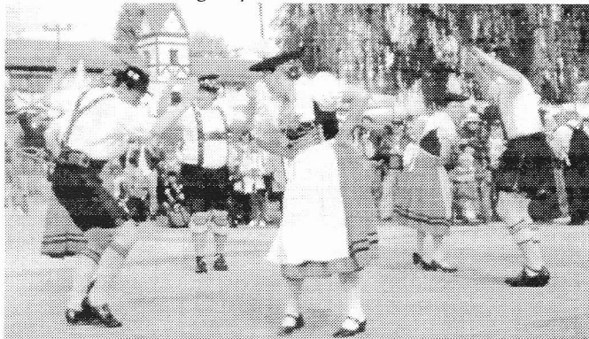
A Portland dance group adds to the merriment. (below)

other attractions represented cities throughout the Pacific Northwest. Streets were closed (right) and