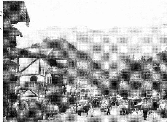
Alpine showers in the nearby mountains failed to dampen the spirits of Autumn Leaf revellers. (left)

The majestic mountain peaks surrounding Leavenworth (above) provided a magnificent backdrop for our meadow camp. There were autumn leaves, but not too colorful as yet.