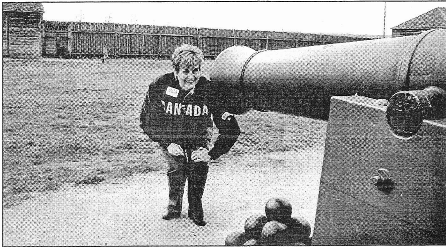
So this is what they used back then!