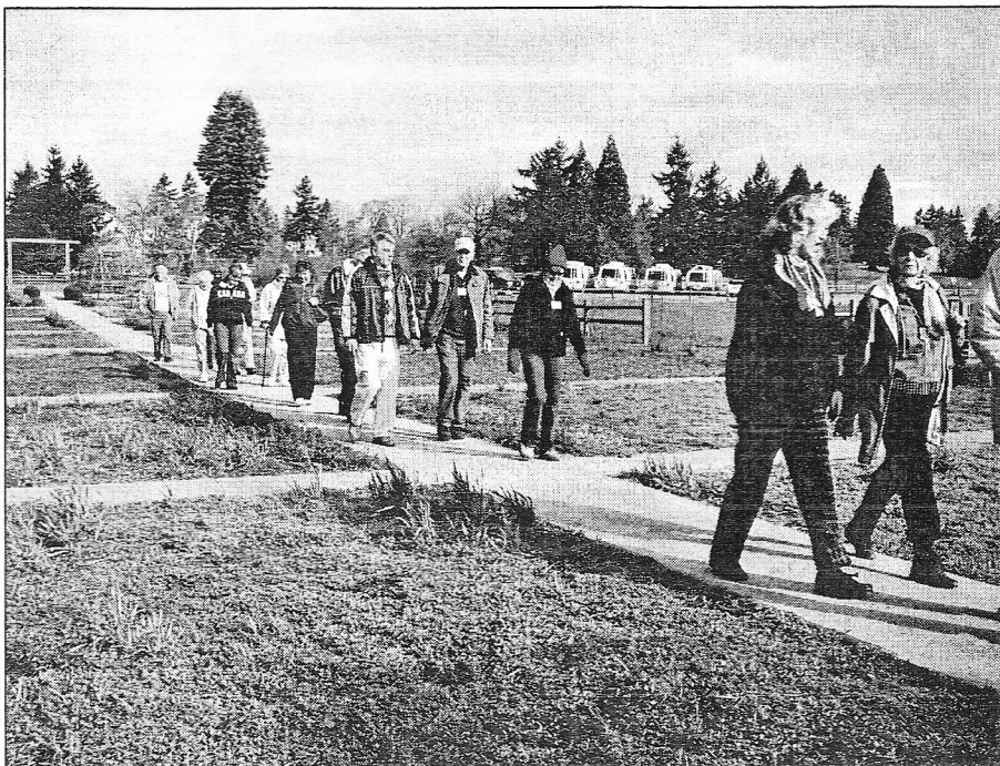
Entering Fort Vancouver