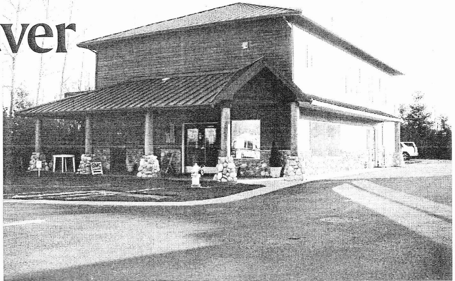
Vancouver RV Park Digs